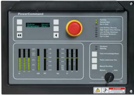
PowerCommand (2100) Control