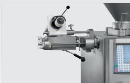
Casing spooling device DA 78-6