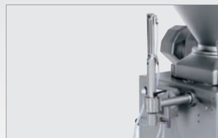
Portioning head 85-2