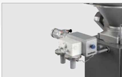
Meat ball forming device 79-0