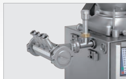
Multi lane flow divider