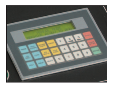
Color Coded Touch Screen