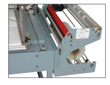
EZ Load Film Unwind