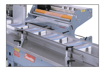
Adjustable Flight Lug Infeed