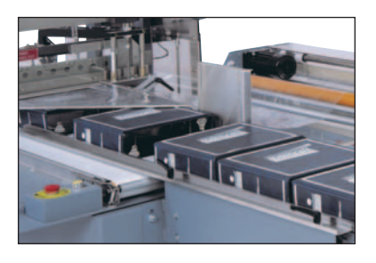
Product Spacing Infeed Conveyor