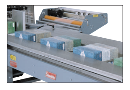
Adjustable Flight Bar Infeed

By selecting just the right combination of options, you can customize your Shanklin A-Series Automatic L-Sealer for the ultimate performance, efficiency and value!