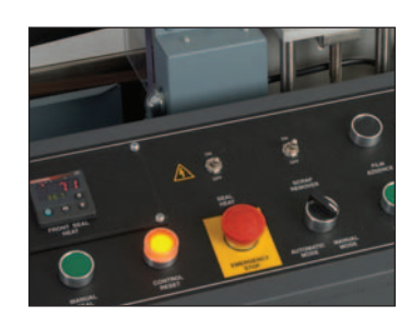
User Friendly Control Panel