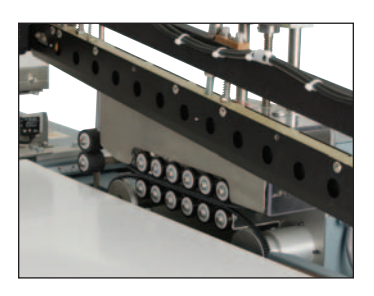
Automatic Film Puller