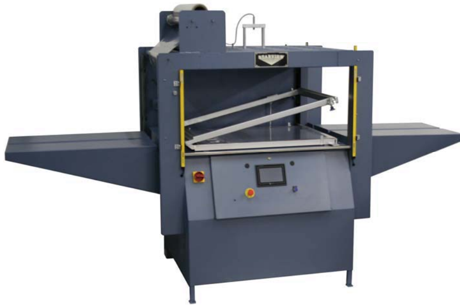
SP Series Skin Packaging Machine shown with Optional Class 4 safety, automatic film clamping frame and film temperature sensor system