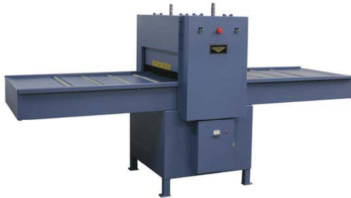
Typical RP Die Cutting Machine