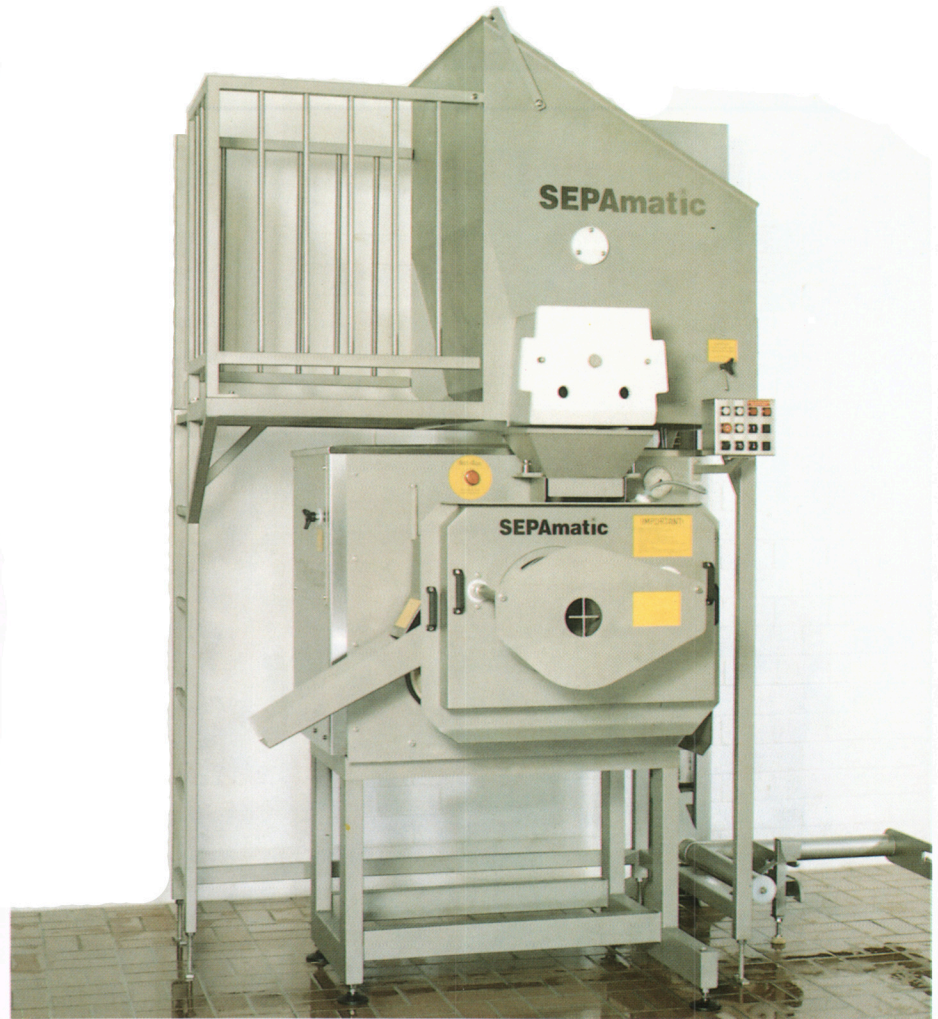
SEPAmatic with feeding-device.

Simultaneously, the basic SEPA 1200 version, which can be combined with all known conveying techniques, is already equipped with all necessary control devices for fully automatic operation. Our designer has been more than generous. The enormous axle diameter with overdimensioned bearings, the