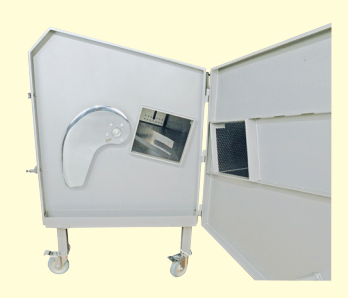
Model 109PC & 109PCM Fresh Product Pusher Gripper Assembly

Model 109PC & 109PCM Left door open showing a Sickle-type smooth Blade and the Surplus Catch Tray. The Stainless Steel Catch Tray allows the further use of the slicer's product's surplus pieces. Use pieces for stir fry, fajitas, and for further processing like ground meat. This advantage qualifies this machine to have a virtually